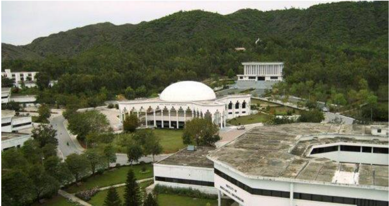
An aerial view of Ghulam Ishaq Khan Institute of Engineering Sciences & Technology, Campus, Topi, Khyber Pakhtunkhwa, Pakistan.

In October 2012, the Bestway Foundation Pakistan made a donation of Rs. 10 Million to North West Pakistan's premier engineering institution. The donated funds are to be utilized for Infrastructure Development and upgrading & augmenting of academic blocks, students' hostels etc.