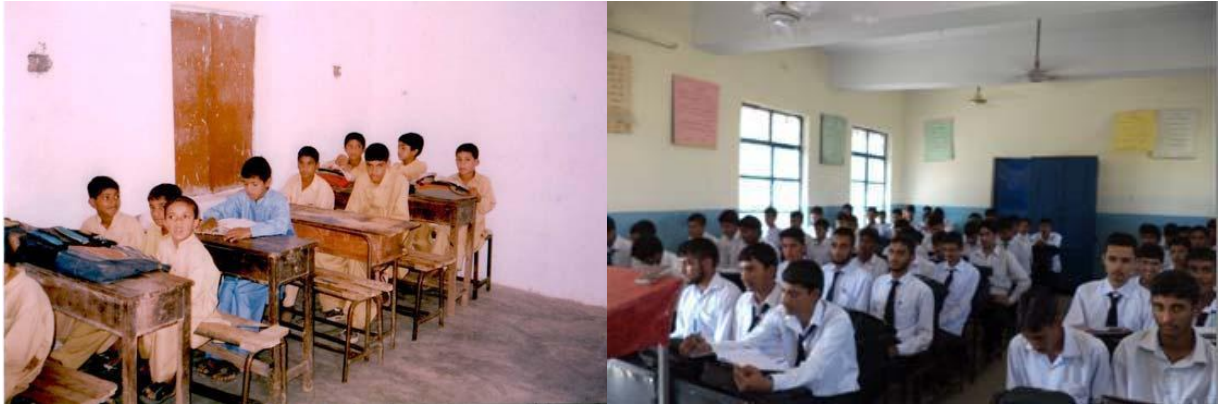
Students attending classes at the Jabbar High School, Jabbar, Thatti, Pakistan, December 2005

The adoption programme provides an opportunity to put to trial an exciting, innovative yet immediately practicable model of localised management of schools through the creation and development of institutions that are co- sponsored by the local District Government and Bestway Foundation.