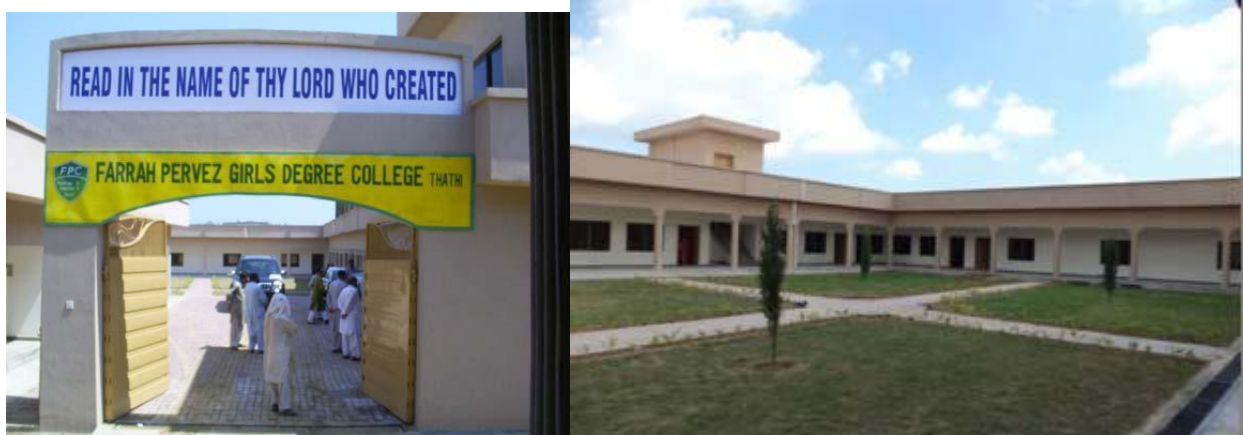
Entrance of Farrah Pervez Girls Degree College, Thatti, Pakistan.

Bestway Foundation has invested in excess of US$ 300,000 towards the construction of a pioneering Girls College in Thatti; Gujjar Khan, Pakistan. The construction was completed in 2012 and the classes commenced in September 2012. This college will provide opportunity to girls for free college education at their doorstep.