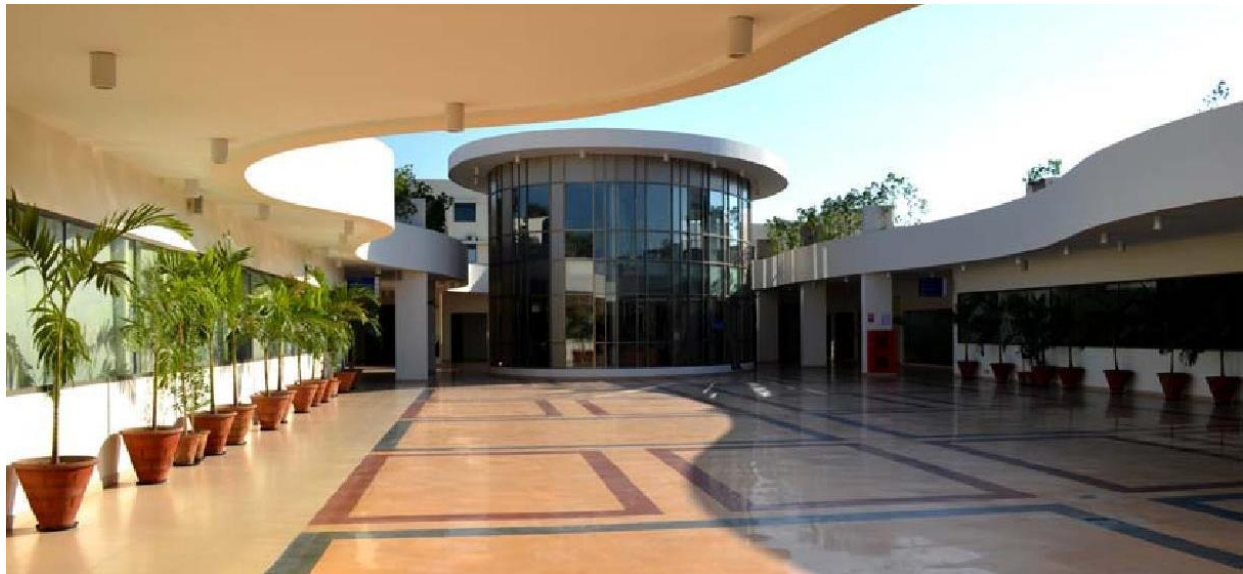
The newly constructed state of the art Karachi School of Business & Leadership Campus, Karachi, Pakistan.

been established as part of the Karachi Education Initiative that seeks to upgrade Pakistan's commercial hub's business and management education infrastructure.