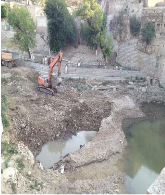
Katas Raj prior to restoration.